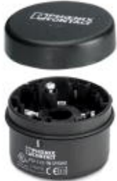
Connection element with spring-cage terminal blocks for tube mounting

Please be informed that the data shown in this PDF Document is generated from our Online Catalog. Please find the complete data in the user's documentation. Our General Terms of Use for Downloads are valid ( http://phoenixcontact.com/download )